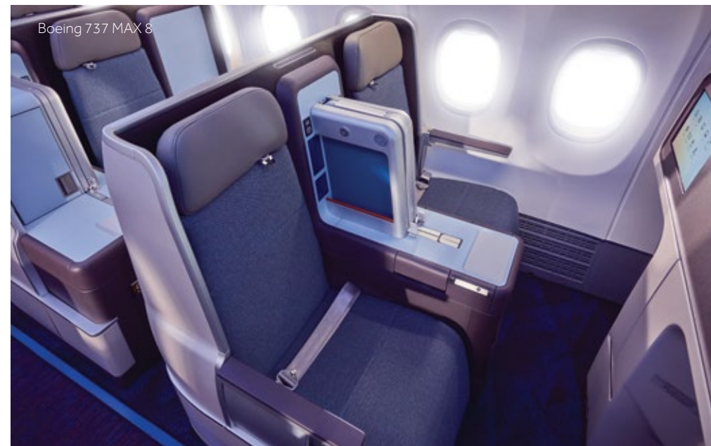
Boeing 737 MAX 8

flydubai Business Class offers a more convenient and personal flying experience with priority ground services, a dedicated Business Team, comfortable and spacious seating, as well as internationally inspired dining options to enjoy during your journey.