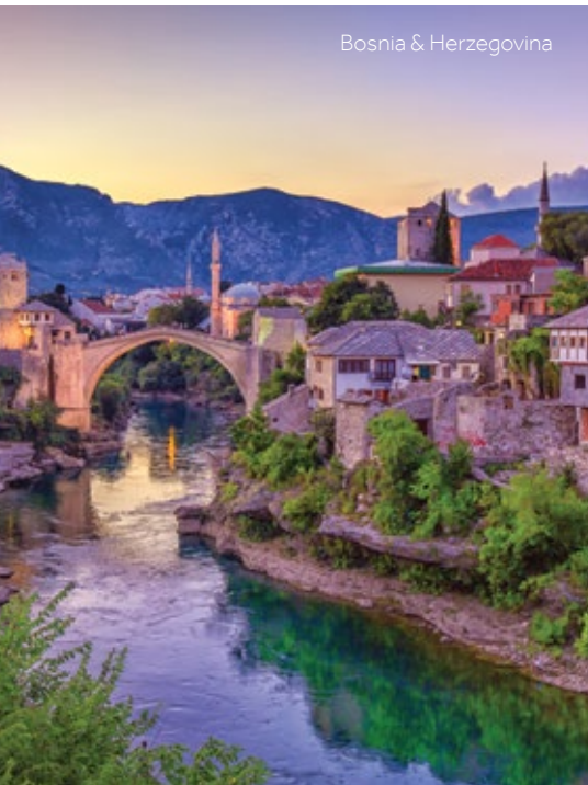
Bosnia & Herzegovina

Nestled in the heart of the Balkans, this mountainous and forested nation harbors a stunning landscape that serves as a backdrop for ancient castle ruins and architecture that reflects the blend of cultures and traditions of the Bosnian people.