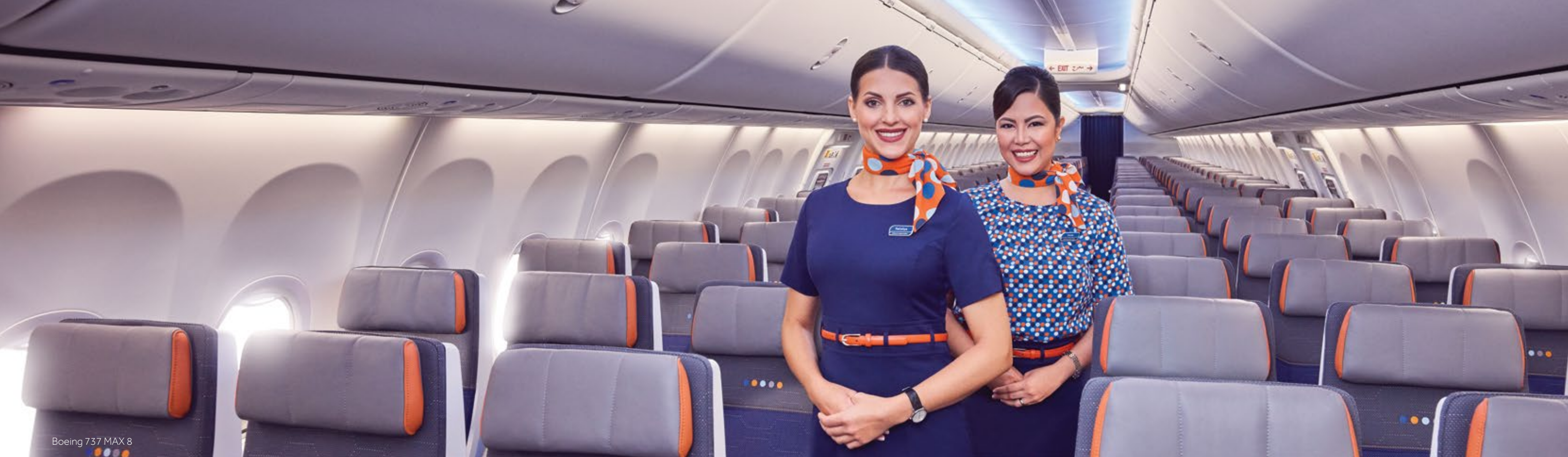
Boeing 737 MAX 8